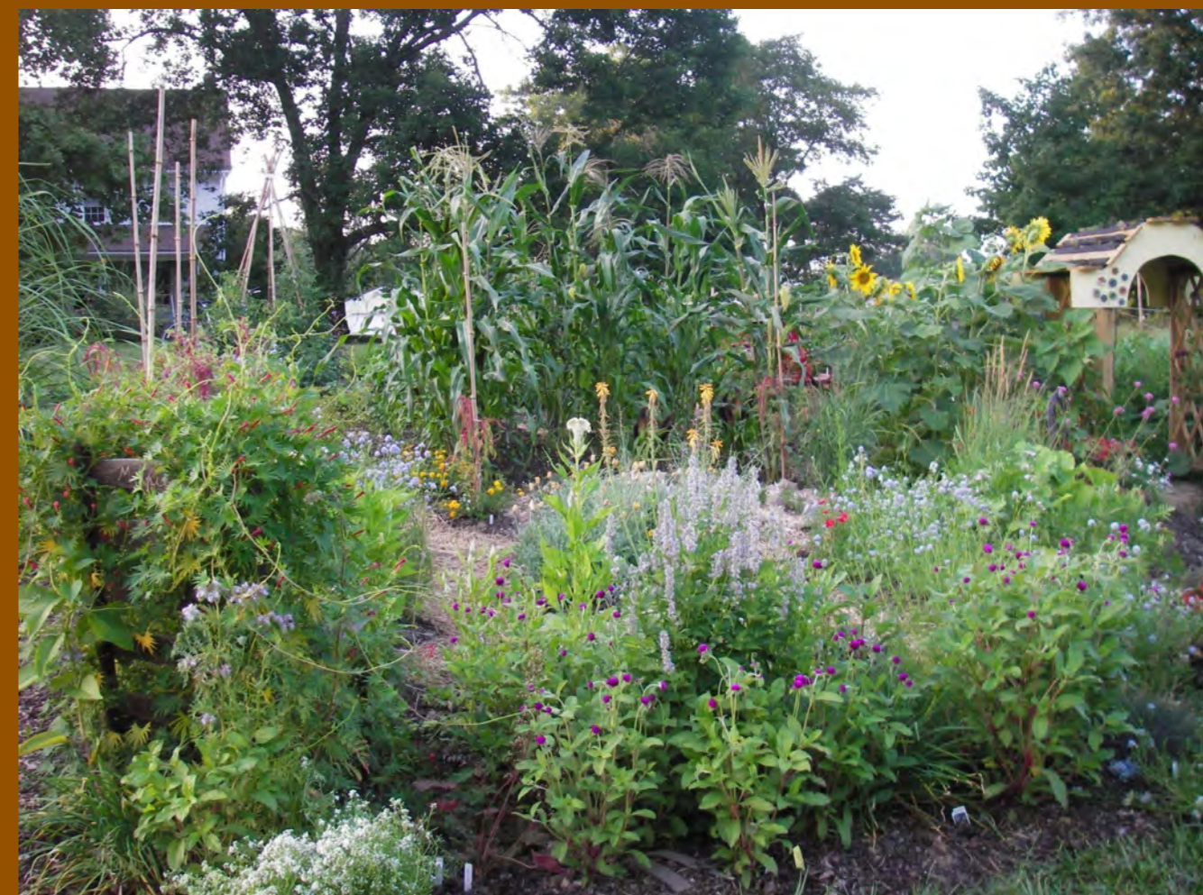
Top: Working in the lily pools Bottom: My personal garden this July

Currently, I am in the first year of the program. It has been the most intense and rewarding experience of my life. I have worked with arborists and climbed trees, waded in lily pools and driven tractors. As part of the program we travel abroad in our second year. Our class will be going to China in October 2012! We are working on fundraising through plant sales.